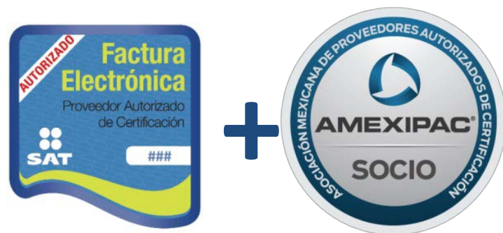
Illustration 2. Official seals of Mexican service providers: PACs.

Left: SAT's Service Provider Identification. Right: AMEXIPAC Member Identification.